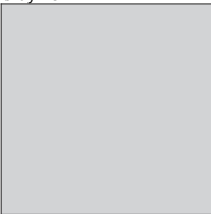
Gray - GRY

Digital: Not all screens are calibrated the same, and therefore, colors will appear differently between screens. Physical: When texture is involved, there will be variations in color, character and tone within a product series and between product families.