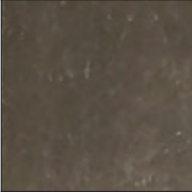
Machined aged solid brass - ASB