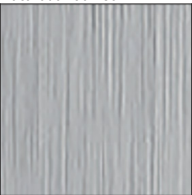
Natural anodized - ANA