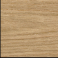
Oak Natural - OAK