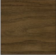
Walnut Natural - WAL