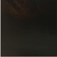
Bronze - BRZ