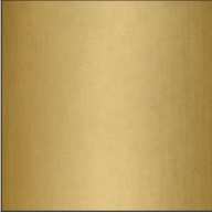
Brass - BRA