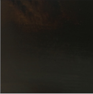
Bronze - BRZ