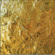
Gold Leaf - GLF