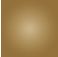
Bronze - BRZ