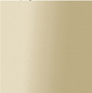
Champagne - CHA