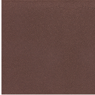
Rusty Angel - 09