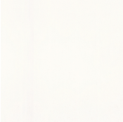
Matte White Lacquer - MWL