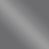
Chrome - CHR