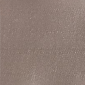
Taupe - TAU