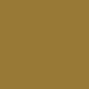
Black Brass - BBR